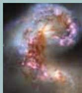
The Antennae Galaxies in Corvus, the Crow, are an iconic colliding pair of stellar metropolises.