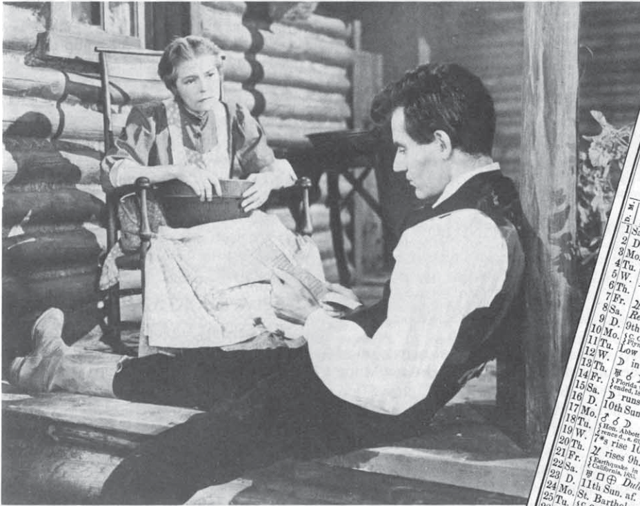
Henry Fonda starred in the title role of Young Mr. Lincoln in 1939.

recalling the days he had spent in the Armstrong home. After a short deliberation, the jury acquitted Armstrong.