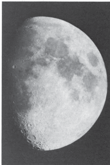
The waxing gibbous Moon shown here is 74-percent sunlit, exactly the same phase as on the night of August 29, 1857. The authors took this photograph near 0 h Universal time on February 5, 1990.

This page from the 1857 Old Farmer's Almanack shows the "Moon runs low" notation near the end of August. The actual almanac used by Lincoln at the trial is not known.