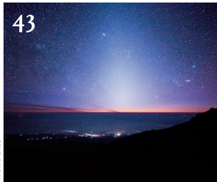
KIVON O CHILU